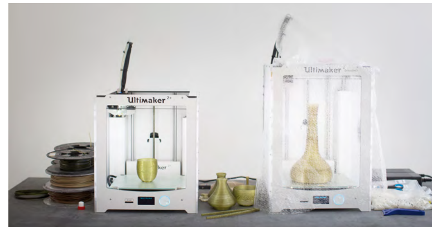
Atelier Luma