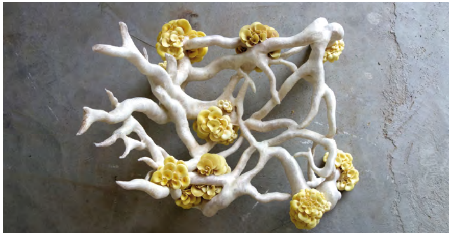
Mycelium chair